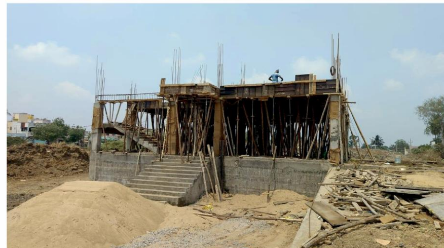
BUCHIREDDIPALEM FIRE STATION, S.P.S.R. NELLORE DISTRICT