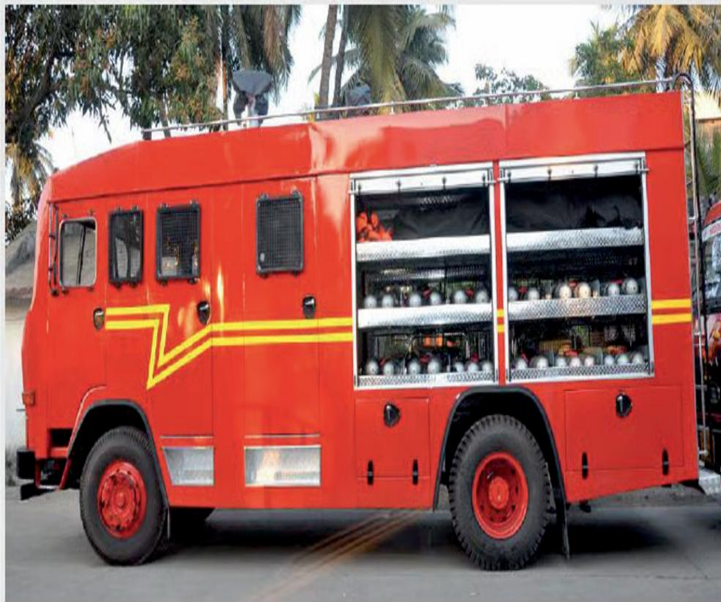
BA SET VEHICLE