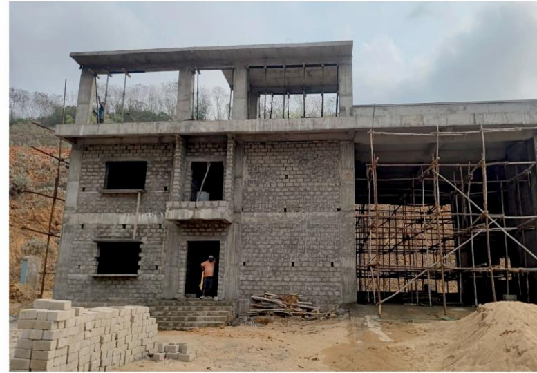
YENDADA FIRE STATION, VISA KHAPATNAM DISTRICT