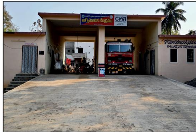
Prattipadu Fire Station, Kakinada District