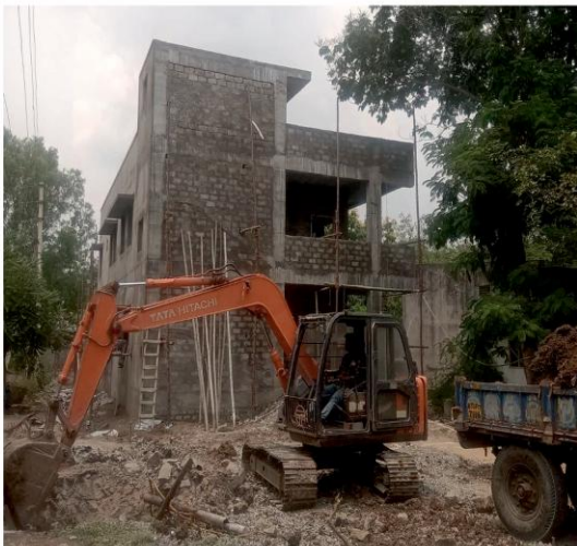
BRAHIMPATNAM FIRE STATION N.T.R. DISTRICT