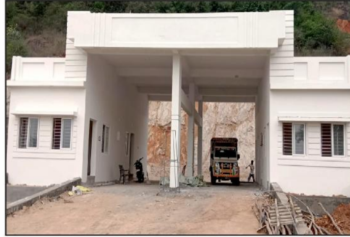
Sabbavaram Fire Station, Anakapalli District