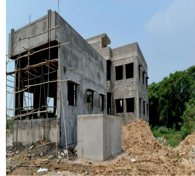
TIRUPATI RURAL FIRE STATION, TIRUPATI DISTRICT