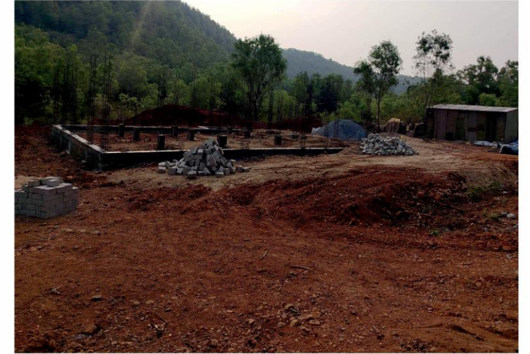
KAPULUPPALPADU FIRE STATION, VISA KHAPATNAM DISTRICT