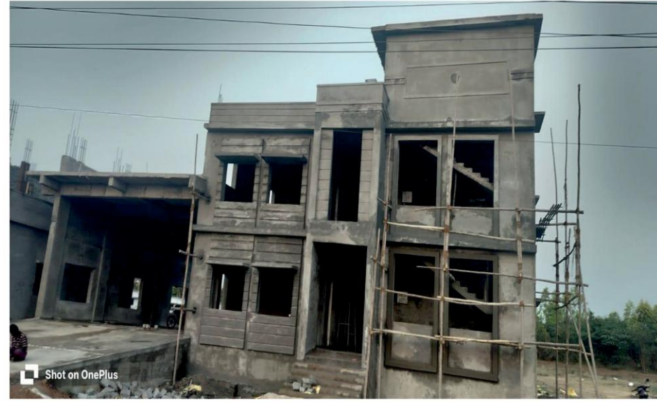
ADDANKI FIRE STATION, PRAKASAM DISTRICT