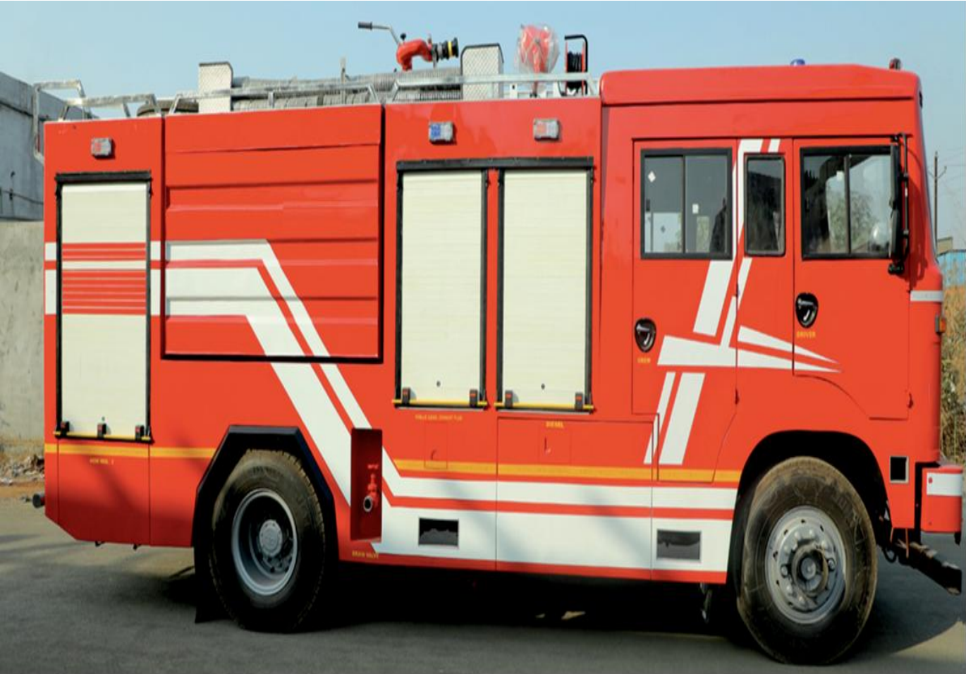
WATER TENDER WITH SEARCH & RESCUE EQUIPMENT