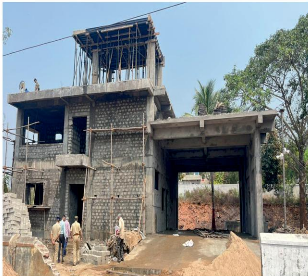
SIMHACHALAM FIRE STATION, VISA KHAPATNAM DISTRICT