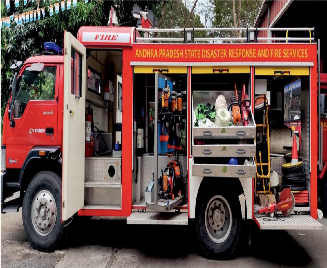
LIGHT/MINI RESCUE TENDER