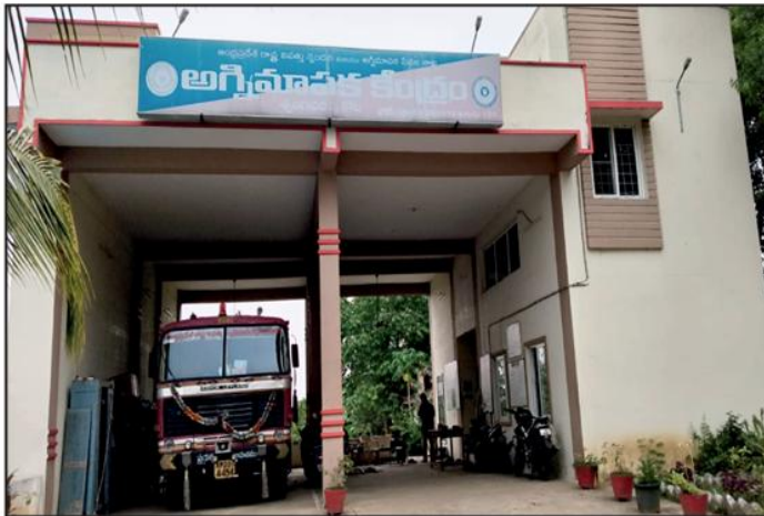
S. Kota Fire Station Vizainagaram District