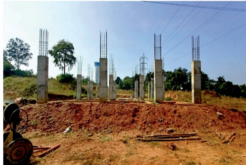
CHINTOOR FIRE STATION, ALLURU SITA RAMA RAJU DISTRICT