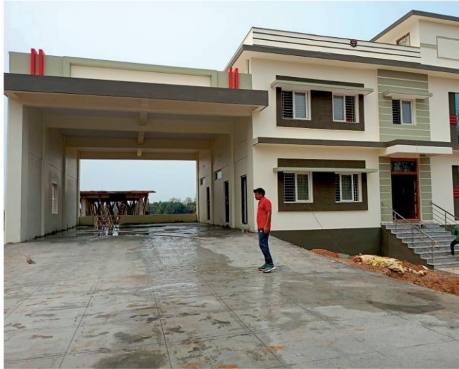
NATHAVALASA FIRE STATION, VIZIANAGARAM DISTRICT