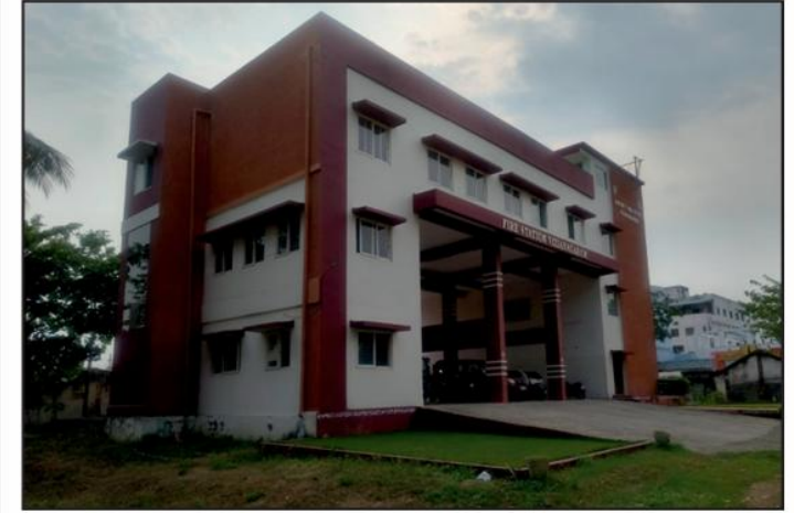
District Fire Office, Vizainagaram District