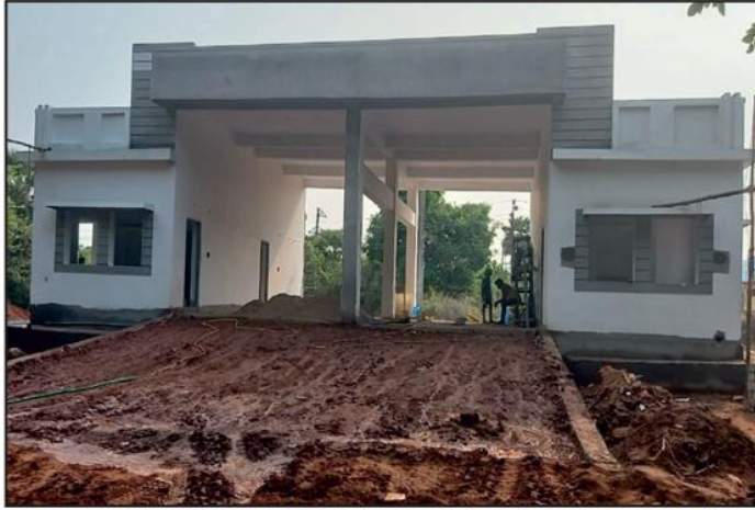
Rampachodavaram Fire Station, Alluri Sitaramaraju District