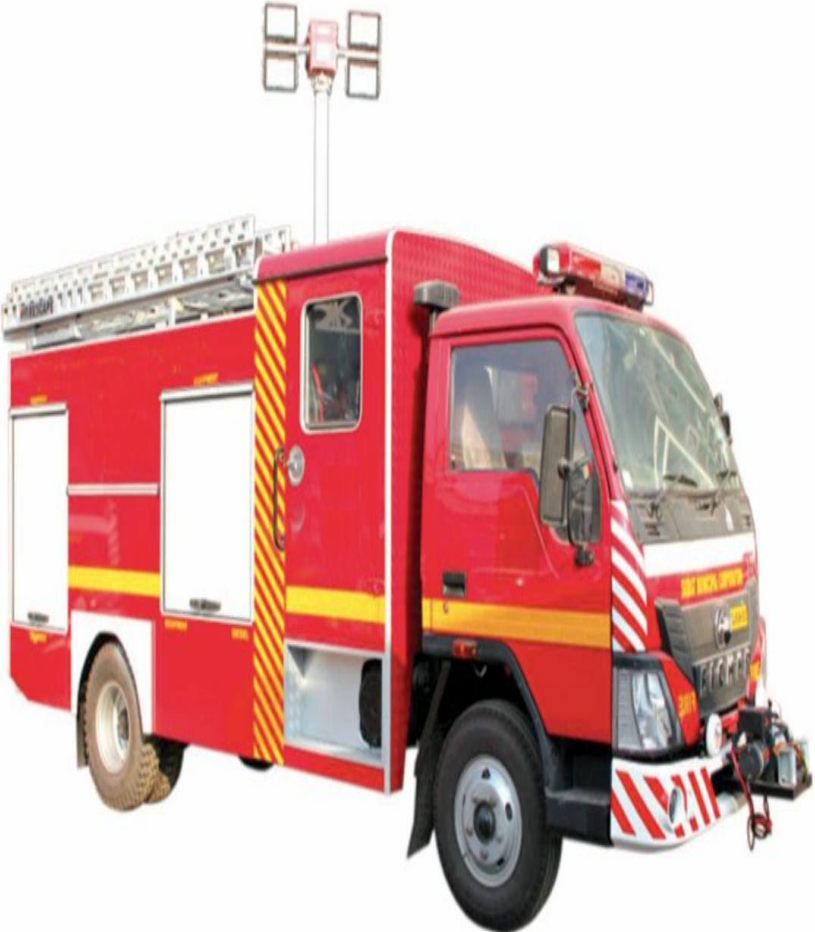
MINI WATER TENDER WITH MIST TECHNOLOGY