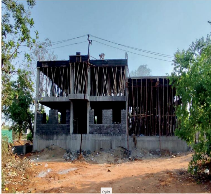
RAJAMAHENDRAVARAM RURAL FIRE STATION, EAST GODAVARI DISTRICT